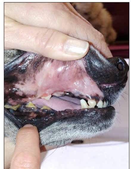
IMAGE D: Approx. 2 Months Post-Treatment No Evidence of Cancer 5/31/2018

RELEVANCE: Oral tumors in dogs and cats are relatively common. According to the American College of Veterinary Surgeons (ACVS), "benign and malignant tumors of the oral cavity account for 3-12% of all tumors in cats and 6% of all tumors in dogs." This maxillary sarcoma was not a candidate for surgical removal and systemic treatment may have caused additional issues for the dog. Due to this rapid response, single-fraction treatments may be preferable to ensure precise delivery of high-dose radiation to the tumor before the target begins to shrink.